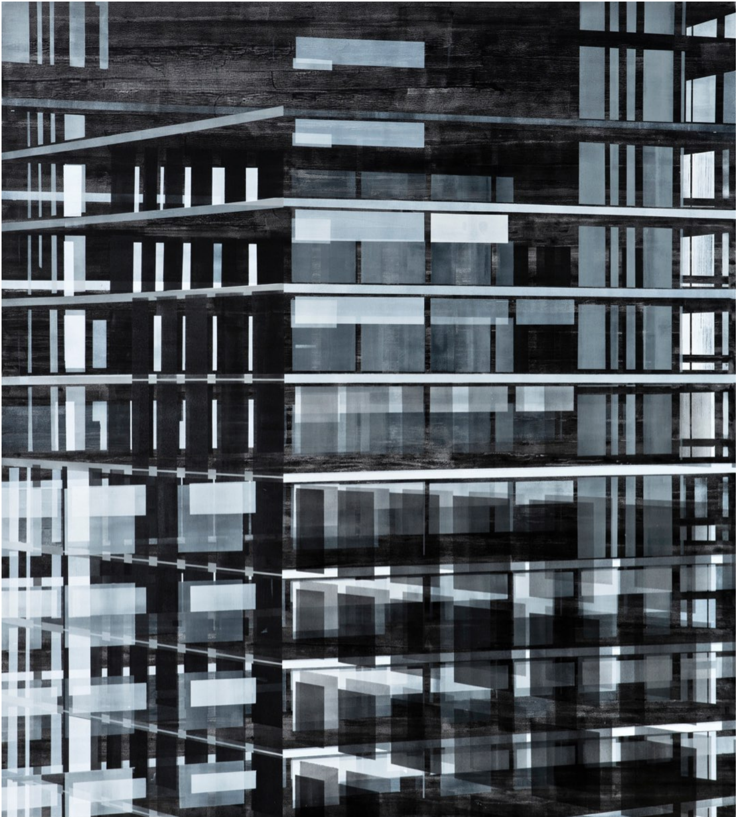
Nuri Kuzucan, 'The Loading and Reading of Density, 2016 Acrylic on canvas, 185 x 165 cm