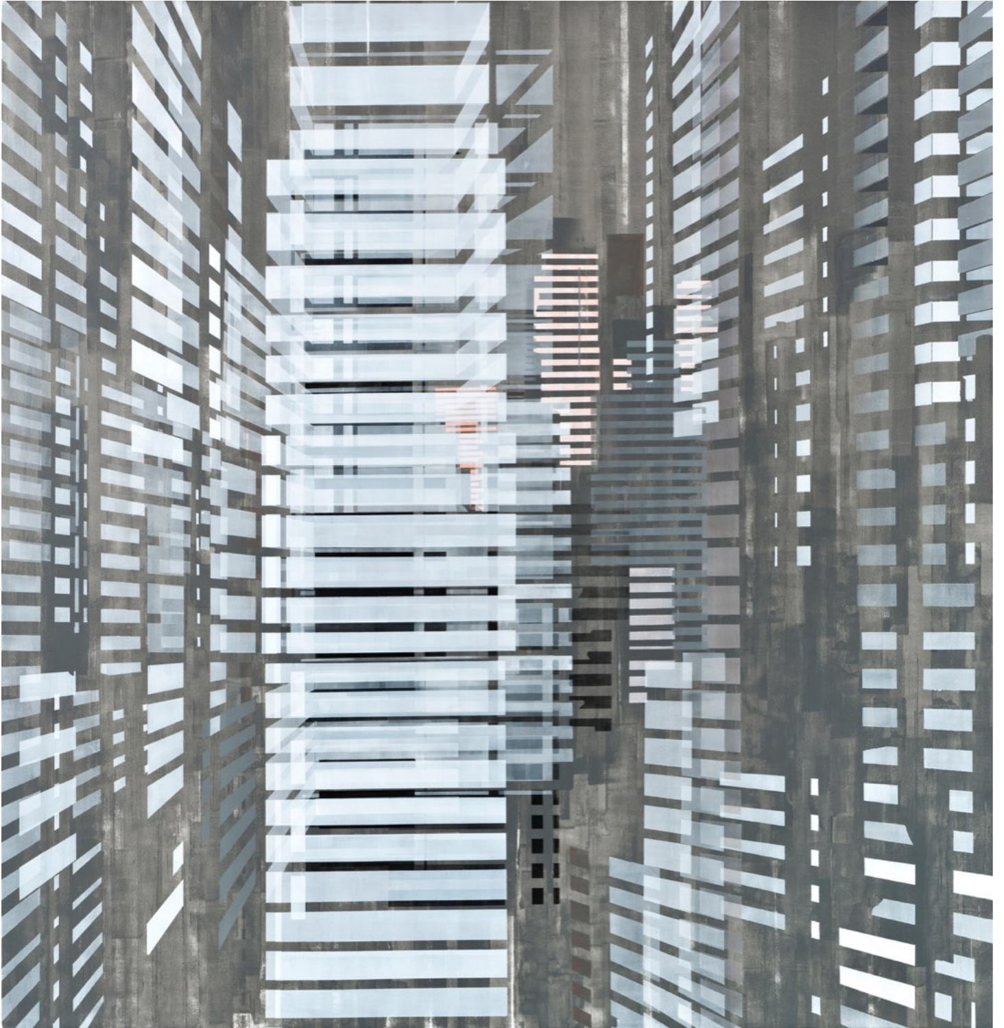
Nuri Kuzucan, 'Singularity', 2016 Acrylic on canvas, 190 x 180 cm